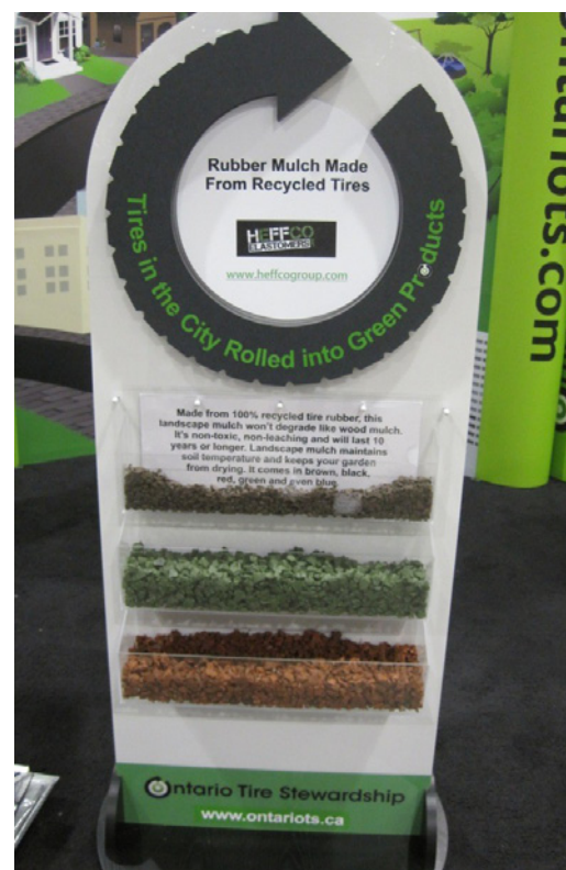
The OTS Display at Construct Canada/PM Expo

Responses from booth visitors ranged from "surprise" at the range of products now available on the market, to specific questions like "Where can we buy this now?". More than 250 visitors to the booth signed up for more information on OTS and the recycled tire products made here in Ontario.