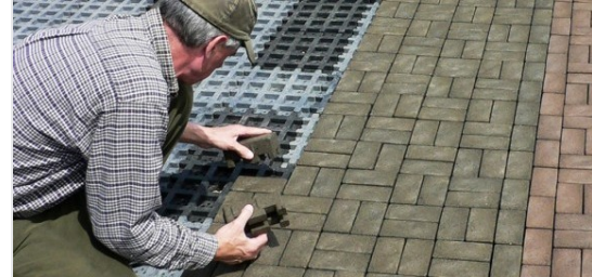
VAST Pavers